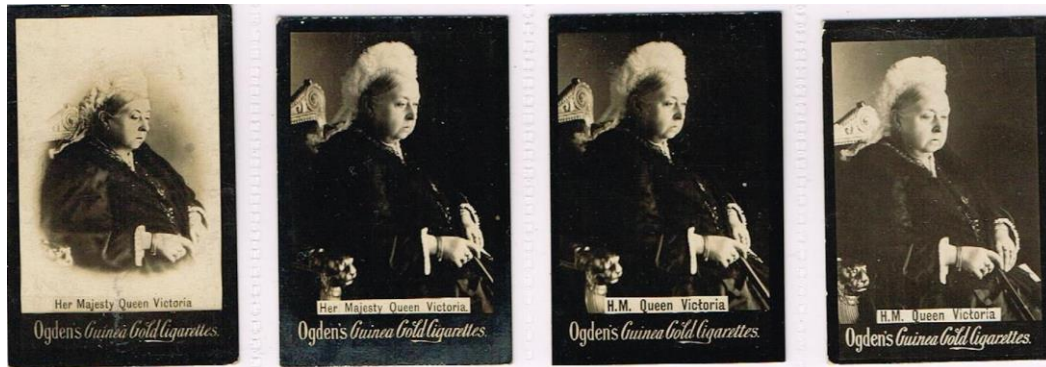
124.5 H. M. Queen Victoria (slightly different angle from 124 – note especially chair back) 3